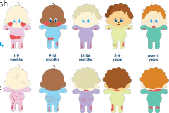
FIGURE 1. Common anatomical locations of atopic dermatitis in infancy and childhood, by age range.